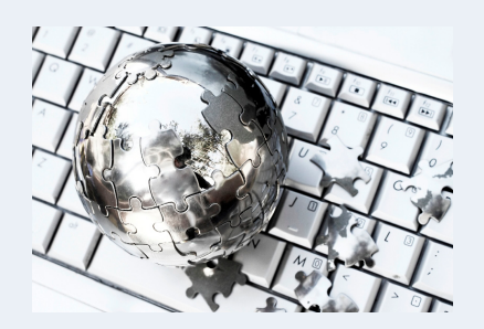
SEVIS Data Migration Completed

The SEVIS data center migration (DC1) occurred from December 2-December 5, 2011. This was the migration of SEVIS to a new data environment. During this move there were some issues that arose with a couple of our interfaces, which had some impact on batch, but most of these issues have been resolved.